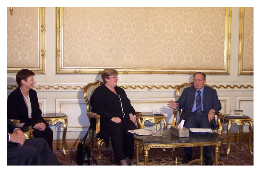
Figure 3 Australian Ambassador Shwabsky, Delegation Leader Ellis and Egyptian Speaker Sourer

2.57 Discussions with the Speaker of the People's Assembly, HE Dr Fathi Sourour, focussed on the differences and similarities of the parliamentary systems of Australia and Egypt, particularly in relation to ethics and also disciplining members in the chambers. It was interesting to note that the constitution is expected to be changed to guarantee that women have a percentage of seats in the parliament. Currently it is more difficult for women to be elected.