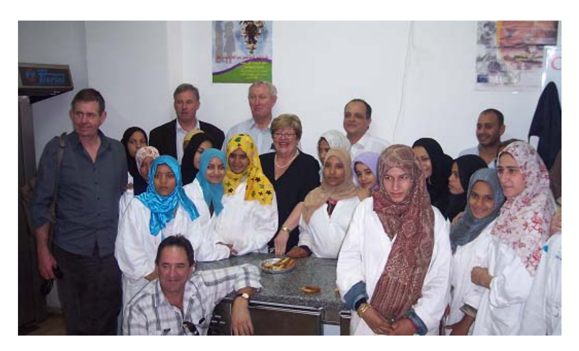
Figure 1 Delegation members with NHASD staff and young women participating in the KidsBake vocational training program