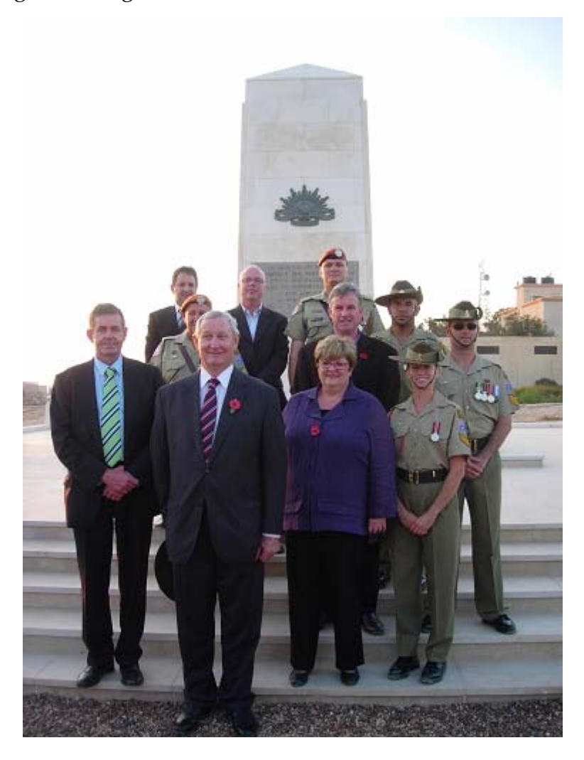
Figure 2 Delegation members with members of the Australian Defence Force serving with the MFO at the Australian 9th Division Memorial

2.48 The delegation also laid a wreath at the Australian 9<sup>th</sup> Division Memorial at El Alamein, honouring the sacrifices of those Australians who served in the region during wartime.