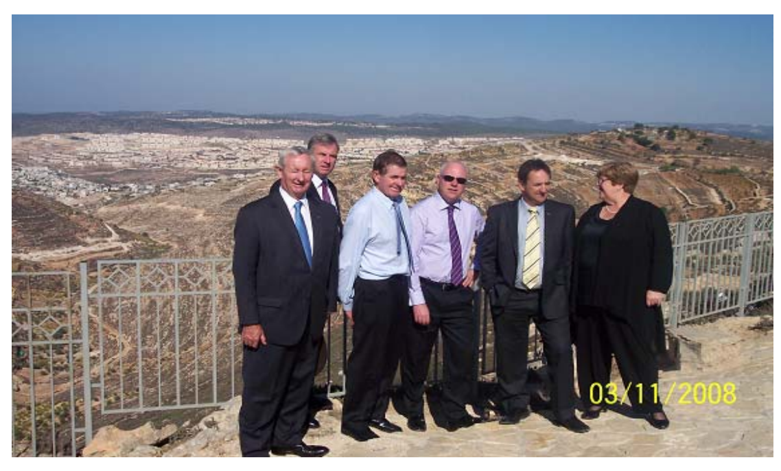
Figure 7 Delegation members at a lookout in the Gush Etzion block, overlooking the Palestinian village of Nahalin and the Israeli settlement of Beitar Illit

4.8 Palestinian representatives expressed considerable unease at the expanding rate of the settlement areas and of 'illegal' outposts, which are usually a forerunner to larger settlements.