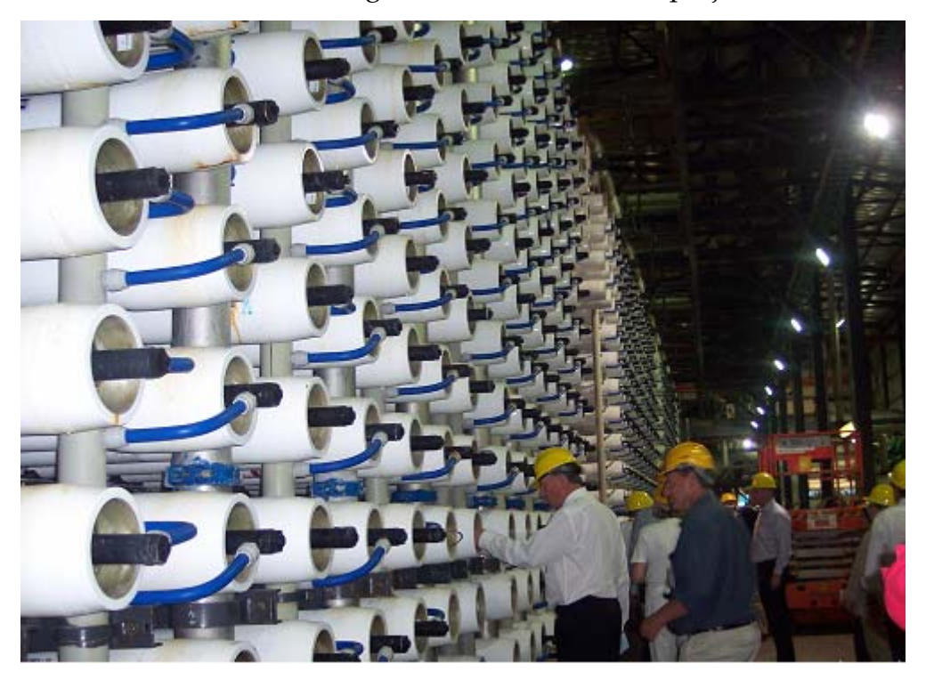
Figure 5 Inspection of Ashkelon desalination plant

presently supplies 7% of Israel's total water needs. IDE Technologies Ltd is a world leader in desalination with 380 plants installed in over 40 countries. IDE has been awarded the design and supply contract by CITIC Pacific Mining for a 51 gigalitre desalination plant at the Sino Iron Project in Cape Preston, Western Australia. IDE has also constructed plants at Hayman Island and Kalgoorlie and had an involvement with a range of other desalination projects in Australia.